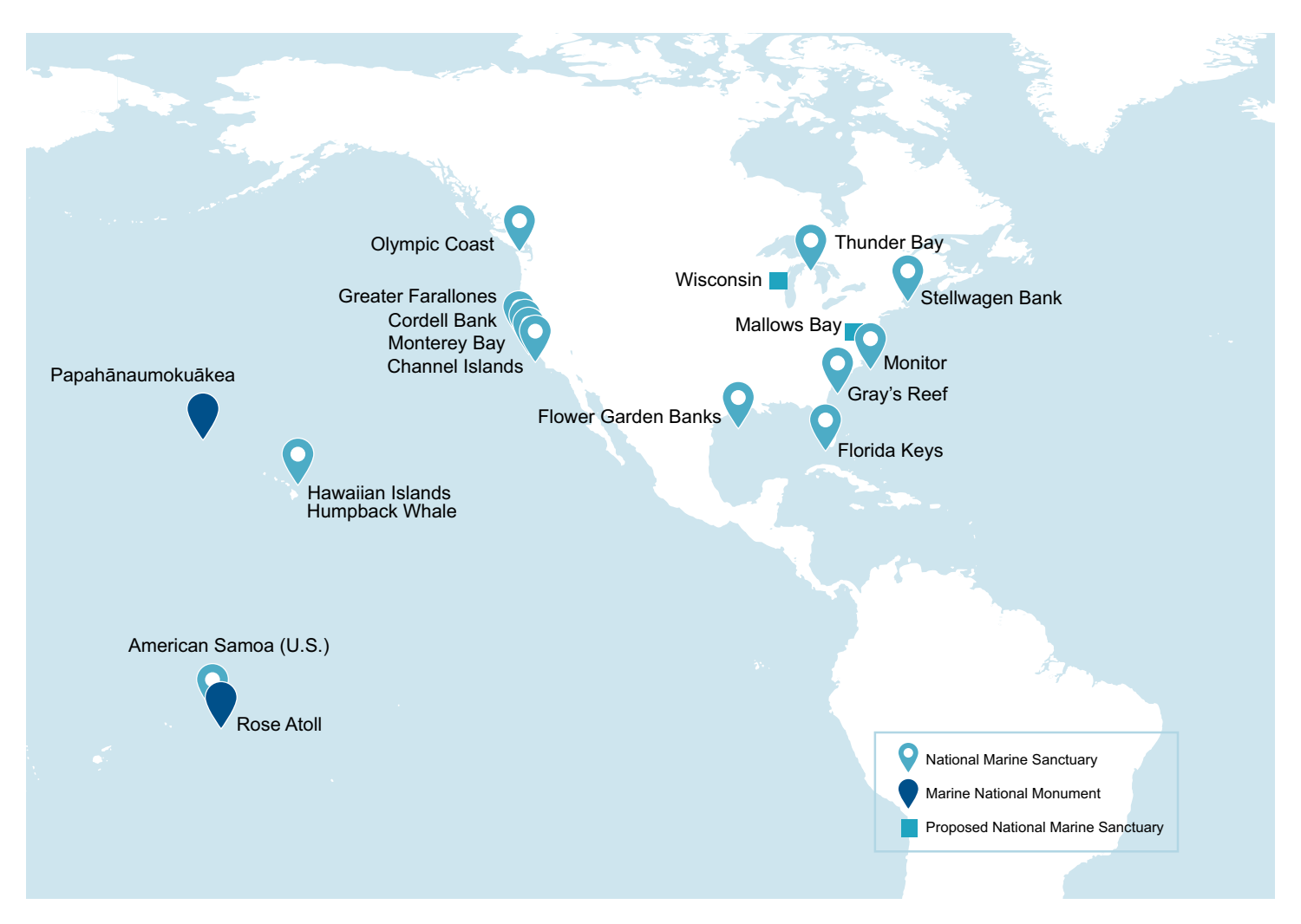
The Office of National Marine Sanctuaries headquarters and the Marine Protected Areas Center are located in Silver Spring, Maryland.

We are a network of 13 national marine sanctuaries and two marine national monuments, encompassing more than 600,000 square miles of ocean and Great Lakes waters. We seek to protect the extraordinary scenic beauty, biodiversity, historical connections and economic productivity of these areas so they may continue to serve as the basis for thriving recreation, tourism and commercial activities that drive coastal economies. As stewards of these places, through domestic and international partnerships, we help ensure a healthier ocean, now and for future generations.